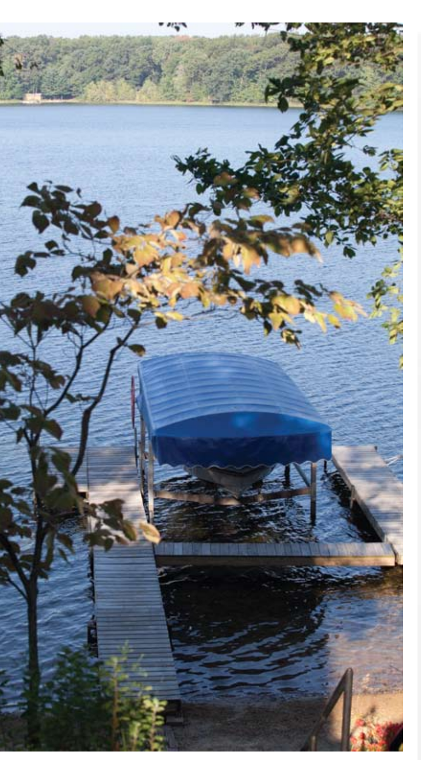
Scenic lakefront views abound from every direction.

Appliances, Kitchen/Bath Cabinets, Countertops: THE KITCHEN SHOP