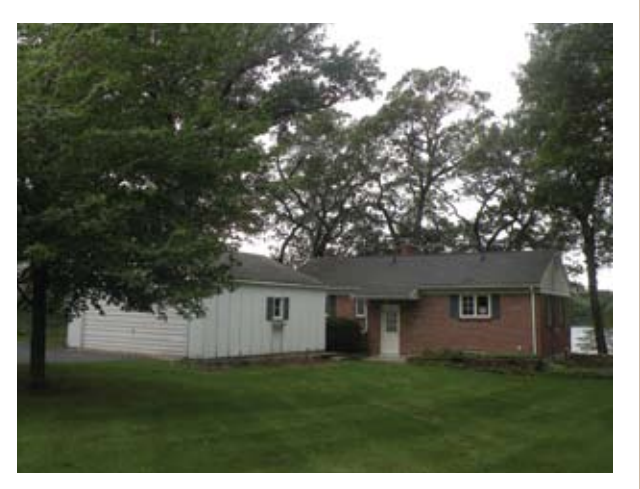
WWW. {\tt MICHIGANHOMEANDLIFESTYLE.COM}